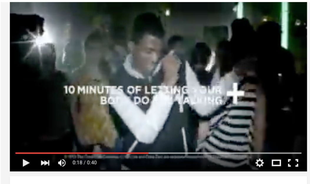
Coca-Cola: 'Be OK' 139 calories advert